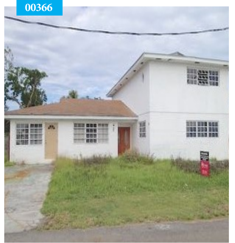
LOT 141 CORAL VISTA SUBDIVISION NEW PROVIDENCE. The building consist of two units. Unit 1 consists of two bedrooms, two bathrooms, living room, dining room, powder room, and kitchen. Unit 2 consist of two bedrooms, one bathroom, living room, dining room, kitchen and storage room. $672,000.00