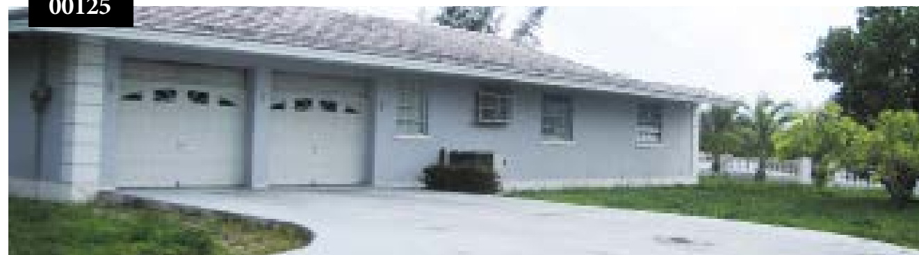
LOT D CYCLOPS GARDENS N.P. Duplex building with each Unit consisting of two bedrooms, one bathrooms and kitchen. Building size: 1,480sq. ft., Property size: 4,600sq. ft. Price: $100,000.00

Directions: Travel west on Cowpen Road, turn right on to Faith Avenue travelling North. Take second corner on left and the subject property is on the Southern side of the corner, building #198.